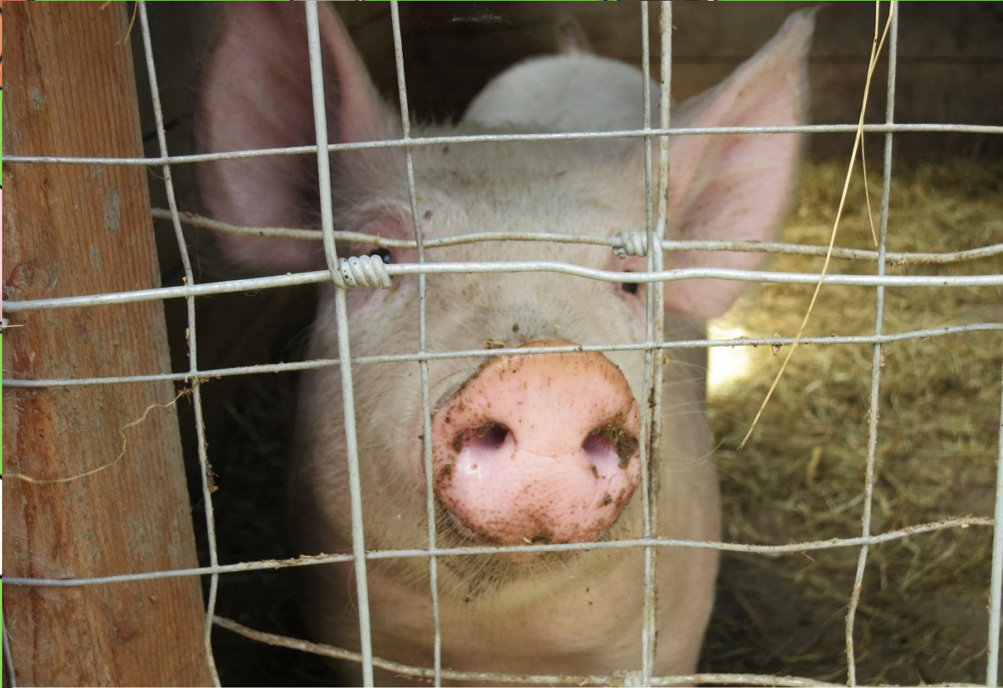
A pig lives in a sty.